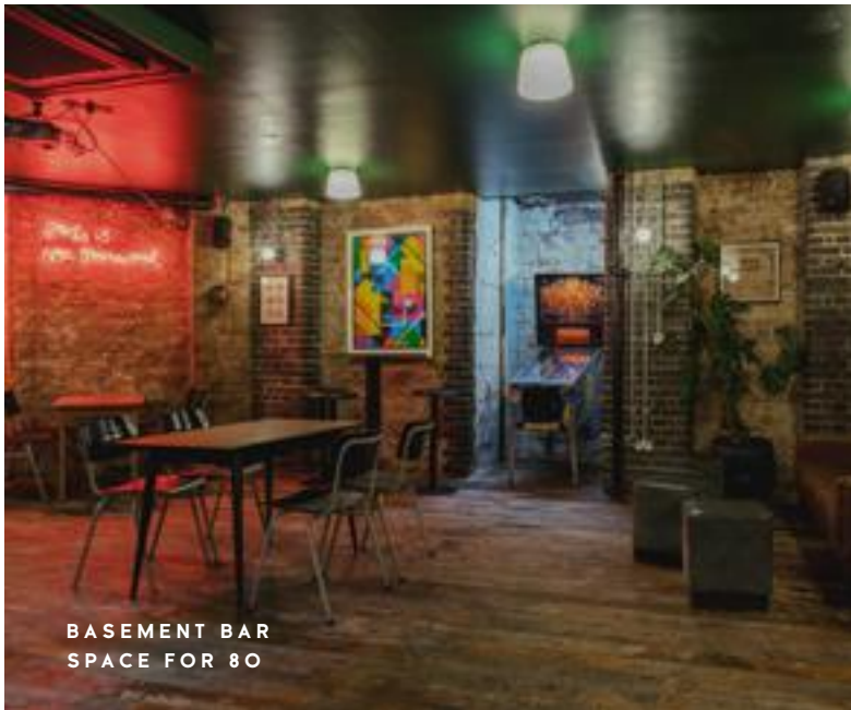
BASEMENT BAR SPACE FOR 80

If you'd prefer to sit down and tuck in with your nearest and dearest then you can choose from our seasonal British feasting menu. Book to eat upstairs in the restaurant or keep it casual downstairs in the basement.