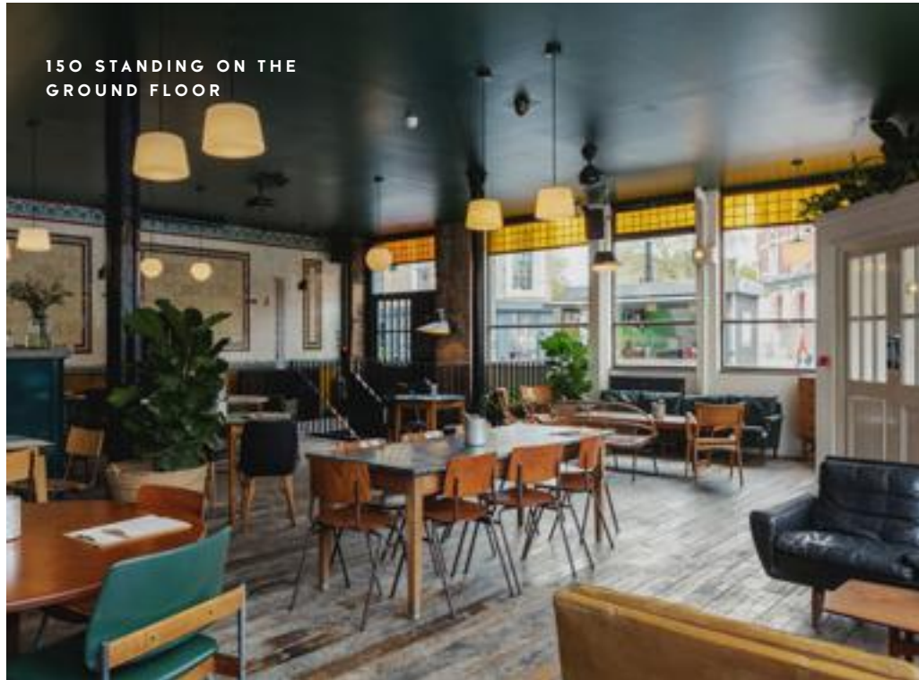
150 STANDING ON THE GROUND FLOOR